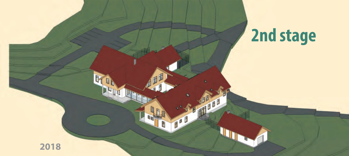
New building: 640 m 2 (6900 sq. ft.)