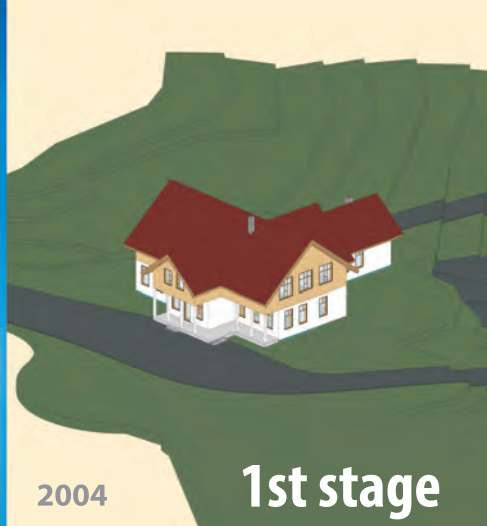
Current building: 570 m 2 (6100 sq. ft.)